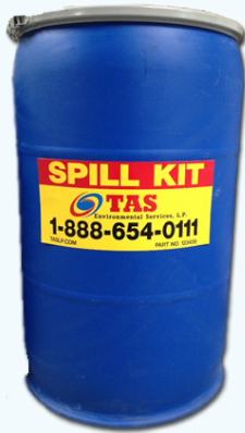
TAS 55 Gallon Spill Kit | $299.00 P/N: Spill Kit 55U-PRD 55 Gallon Universal P/N: Spill Kit 55-PRD 55 Gallon Oil Only