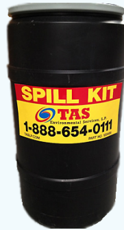
TAS 30 Gallon Spill Kit | $249.00 P/N: Spill Kit 30U-PRD 30 Gallon Universal P/N: Spill Kit 30-PRD 30 Gallon Oil Only