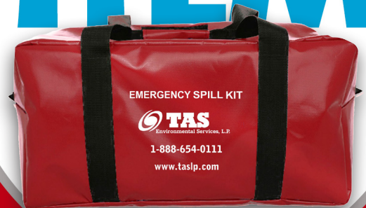
Driver Spill Kit