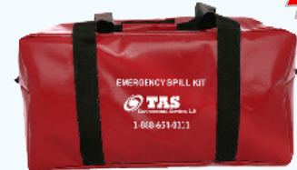
TAS Driver Spill Kit | $179.00 P/N: Spill Kit DRU-PRD Driver Bag Universal P/N: Spill Kit DR-PRD Driver Bag Oil Only